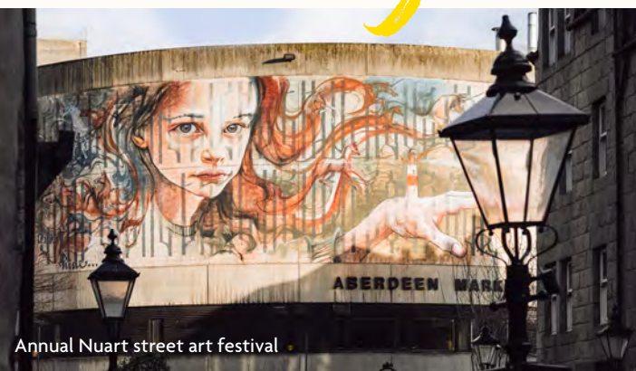
Annual Nuart street art festival